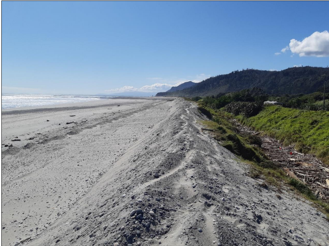
Looking north towards the Mokihinui River